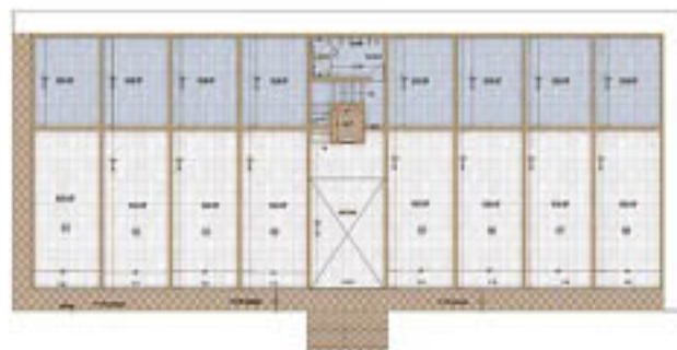
UPPER GROUND FLOOR PLAN