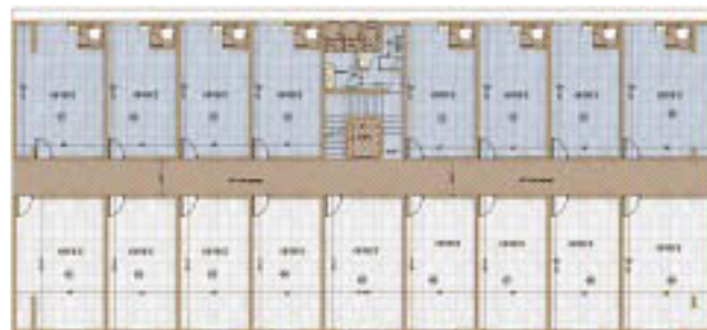
SECOND & THIRD FLOOR PLAN